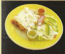
Flautas de pollo

CHIMICHANGA .....$9.00 flour tortilla filled with your choice of meat, green pepper, onions, beans, and mix cheese. deep fried and topped with sauce