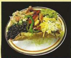
Rico Taco Salad