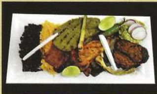
RICO PLATO MIX