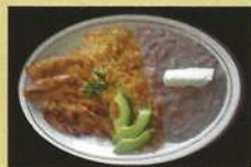
Pechuga a la Plancha