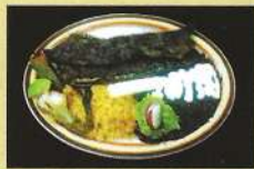
Costillas de Res

BISTEC ENSEBOLLADO, A LA MEXICANA O ASADO .....$14.00 steak and onions , steak mexican style, grilled steak